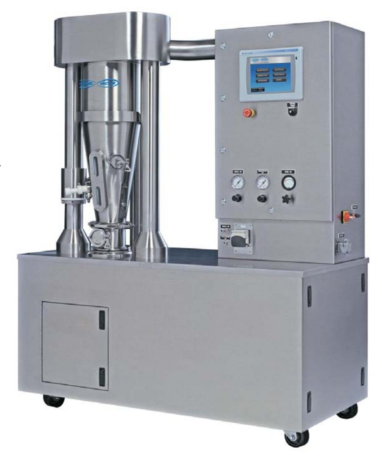
Shown with Optional Touchscreen Control System

Inlet Airflow and Temperature Control Solution Spray Rate Control Process End-Point Control Time, Exhaust or Product Temperature Touchscreen Control (Opt.) Data Collection Port to PC or Printer (Opt.)